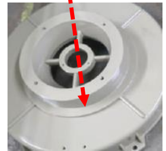
b. Old model (Current)