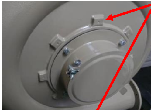
a. New model