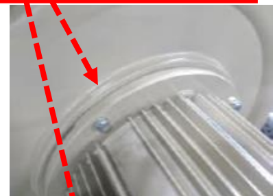
b. Old model (Current)