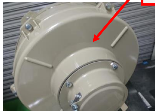
a. New model